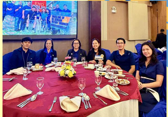
ROTARY CLUB OF GENERAL SANTOS