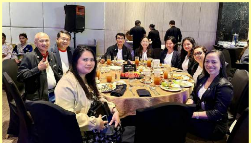
ROTARY CLUB OF DADIANGAS