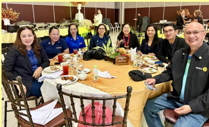
ROTARY CLUB OF METRO KORONADAL