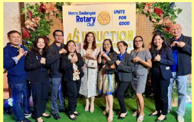
ROTARY CLUB OF METRO DADIANGAS