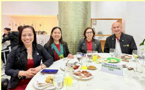
ROTARY CLUB OF GREATER GENERAL SANTOS