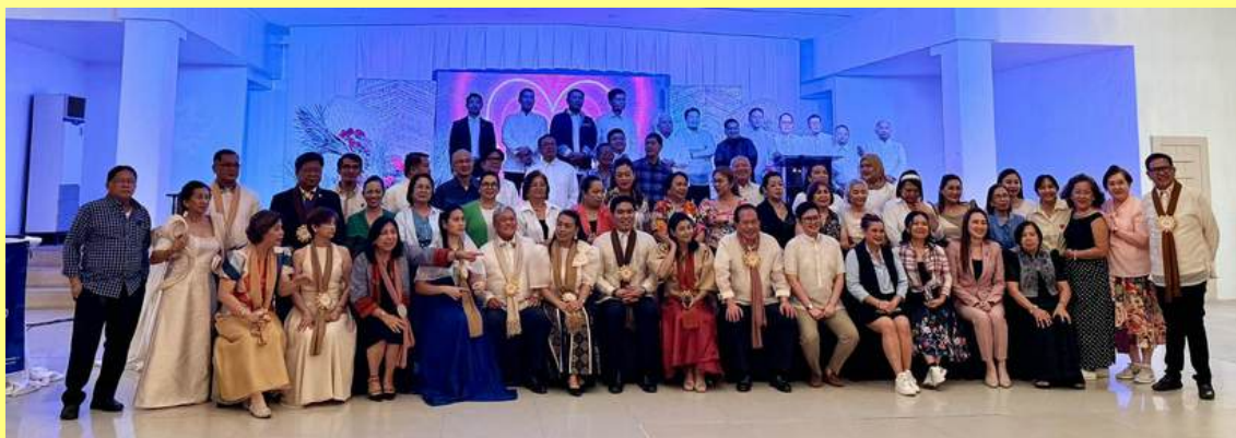
ROTARY CLUBS OF MIDTOWN GENSAN, POLOMOLOK 101 & GENSAN TIUNA PORT