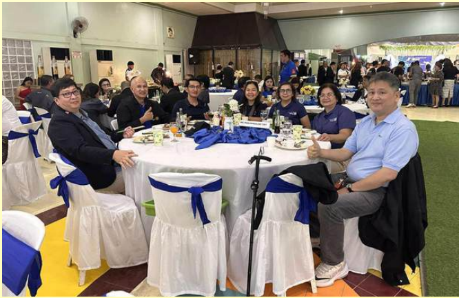
ROTARY CLUB OF UPTOWN GENSAN